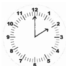
Kell on kaks