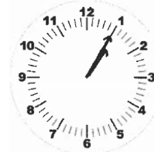
Viis minutit üks läbi