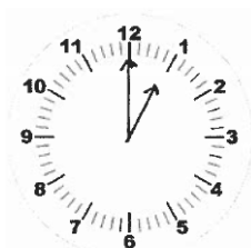
Kell on üks

The following expressions show how to tell the time in Estonian: